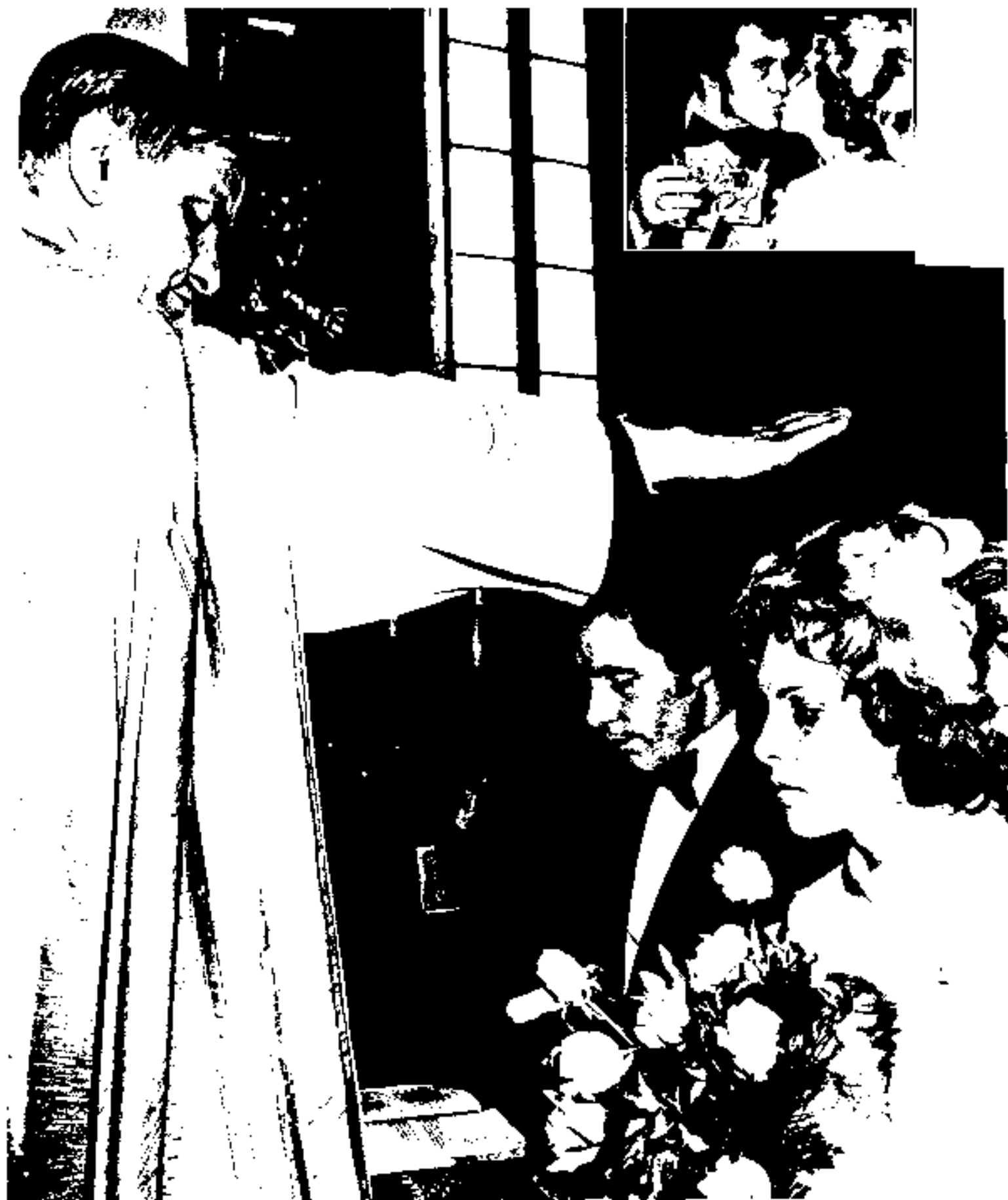
THE BRIDE AND GROOM