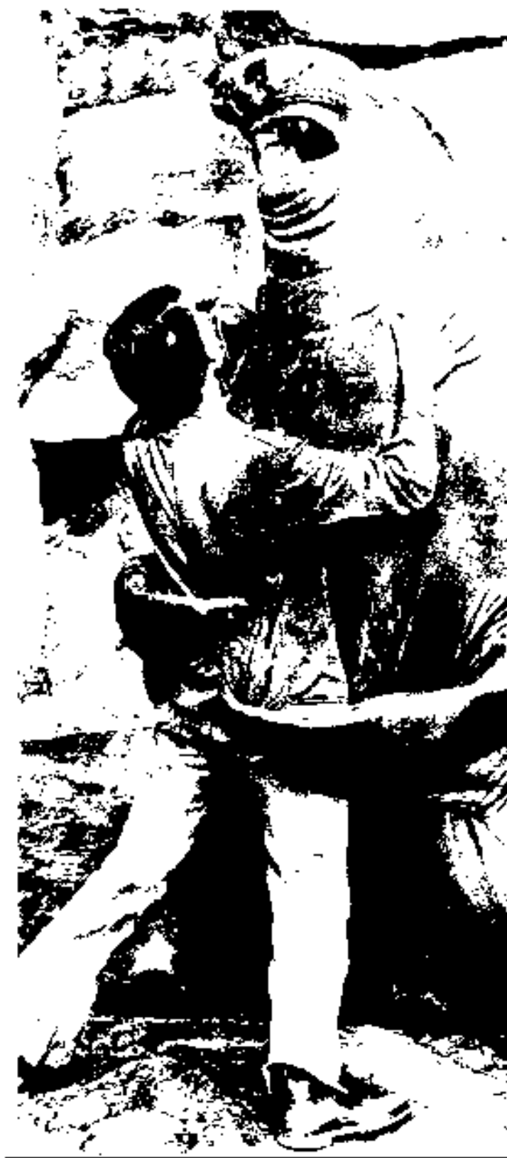
Figure 1. A woman carrying a child on her back.