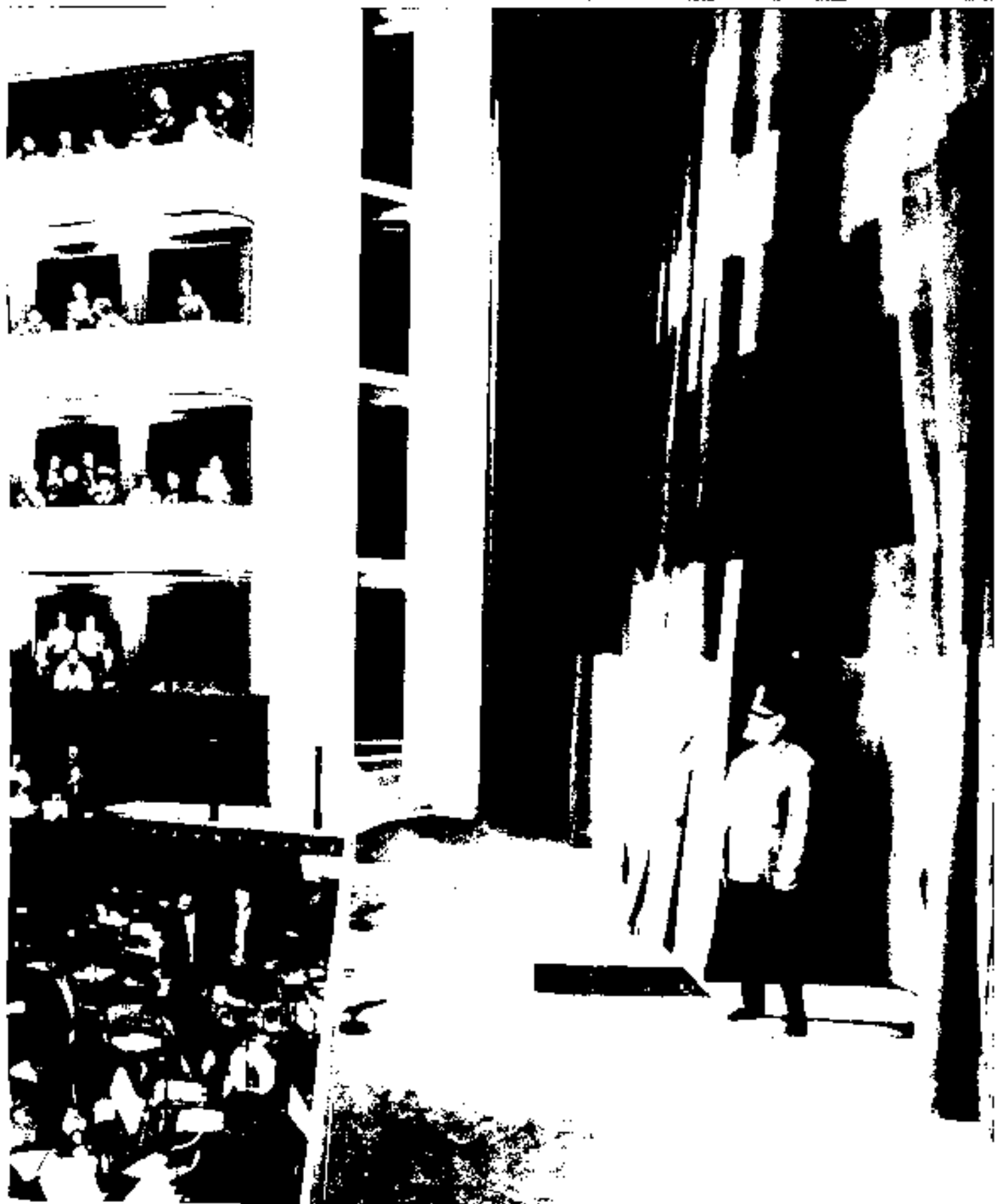
View of the building from the courtyard.